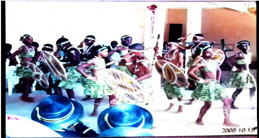
Pic.1. ZULU DANCE TROUPE OF MOUNT OLIVE SCHOOL, ONITSHA PERFORMING AT THE 2008 PRIVATE SCHOOLS' CONCERT.

Some pictorial excerpts of the concert are presented below: