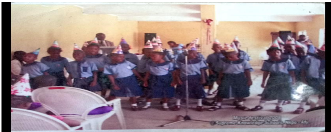
Pic.5. The Host School: Supreme Knowledge Comprehensive School Choir rendering their song at the concert