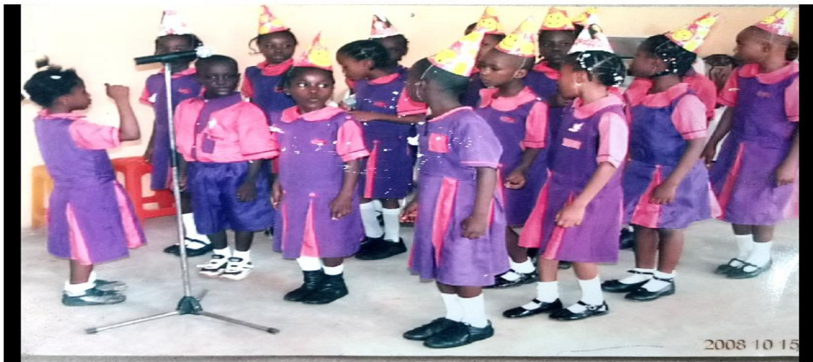
Pic.4. Irene Menakaya School Choir performing at the concert