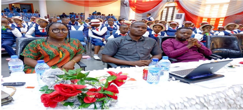
Pic.6. The researcher heading a team of adjudicators in the South-Eastern Nigeria Foreign Languages Schools' Music Concert held at ASUU Secretariat, UNIZUK, Awka in 2024

Music concerts have also existed historically as a competition where winners emerge with prizes, awards, tokens, or cash rewards. The major merit in this type of concert is that it motivates participants towards hard work for the prize as there is given a set piece, set time, and requirements for each repertoire. But the drawback to this system is bias which has been mentioned earlier in this paper. It is very difficult to extricate bias from the minds of the adjudicators due to the fact that people are naturally sentimental. There have been several recorded cases of fights, threatening court cases, and even attacks on individuals after competitive music concerts due to alleged lack or loss of objectivity in the final judgments of the adjudicators. Nonetheless, competitive music concerts help foster social integration, hard work, and discipline but for the problem of objectivity cited.