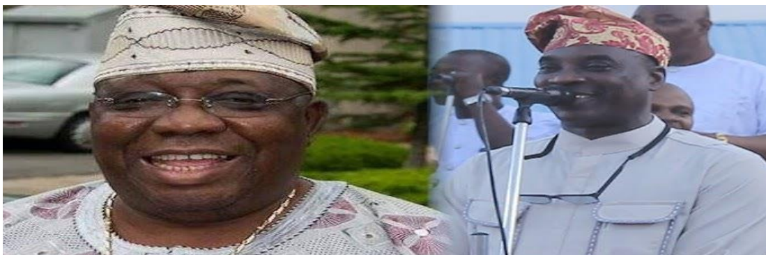
(Mentor) Sikiru Ayinde Barrister